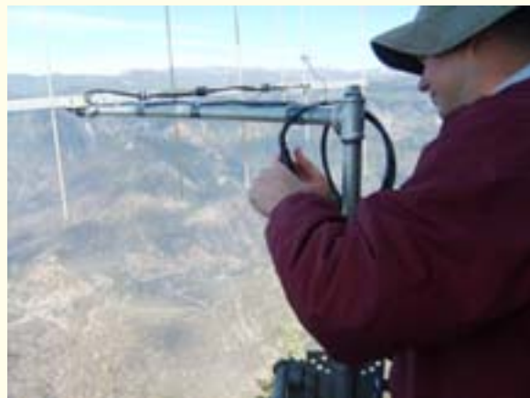
Cody Unruh KG6JYB “weatherizes” the feedline connection.