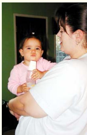
Mom and Baby